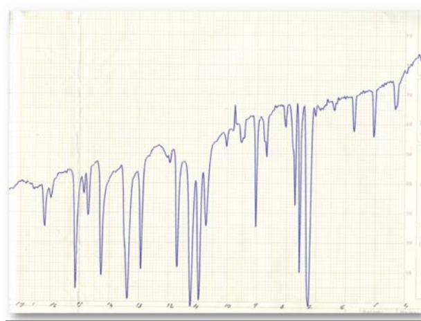
Fig. 1. FTIR spectrum of tris(chloromethyl)copper phthalocyanine

IR spectrum was registered and it is shown in Fig. 1.