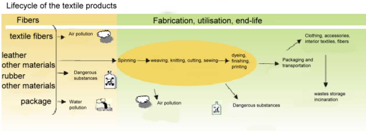
Figure 4. Criteria for evaluating the life cycle of textile products to provide eco-label

must meet to be granted Ecolabel / 6, 7 /. Therefore, the criteria for EU eco-label provided for textiles designed primarily to reduce water and air pollution associated with production process and promotion of textile products with reduced environmental impact (see Figure 4).